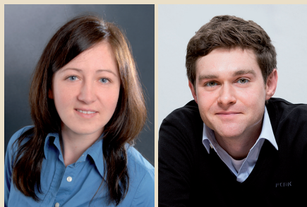
Authors: Dr. Christina Schmidt and Sandro Cocuzza, Hopsteiner, Mainburg, Germany

The breeding of new hop varieties with a multitude of aromas, especially in conjunction with dry hopping, called for the increase and modification of descriptors for the sensory evaluation of the influence of hops when carrying out sensory evaluation of beer. The Hopsteiner flavor wheel presented in figure 1 for hop aroma incorporates the following impressions: “citrus”, “fruity”, “floral”, “herbal”, “spicy”, “resinous” “sugar-like” and “miscellaneous”. Each individual category includes several sub-divisions such as mandarin (for “cit-